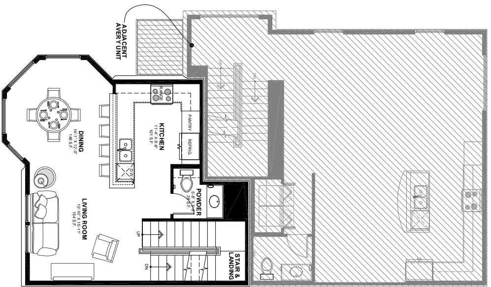
DUNJEE - 3A SECOND FLOOR PLAN Scale: 3/32" = 1'-0" 0 4 8